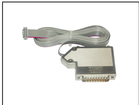
FN-P187 Printer Interface Cable