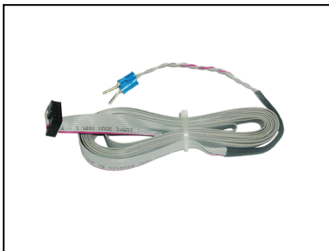
FN-V187 VoiceNET Serial Interface Cable