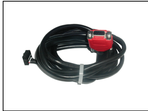
S187 Programming Cable