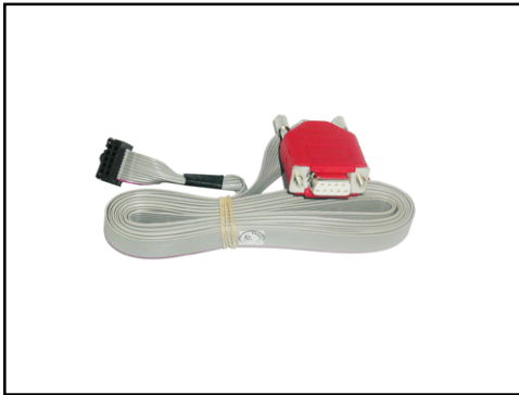
X187 Programming Cable